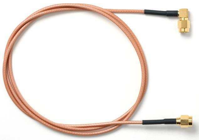
Model 73069 SMA Plug to SMA Right-Angle Plug, RG316/U